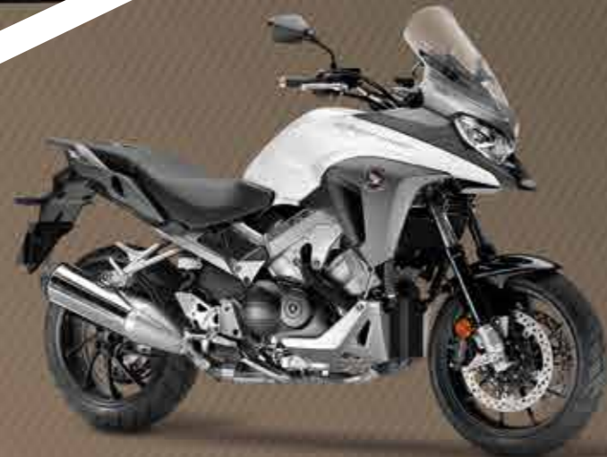
▶ PEARL GLARE WHITE