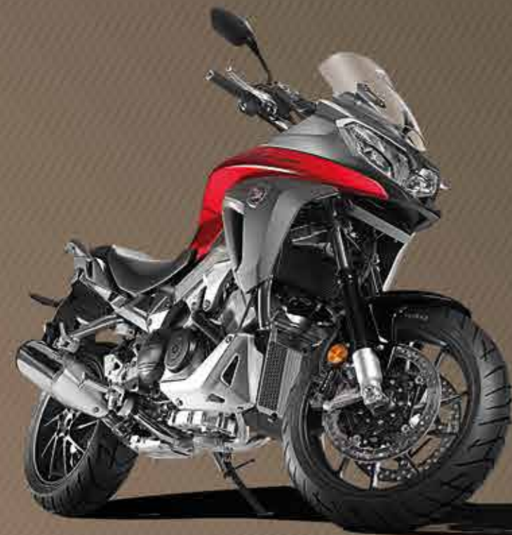
▲ CANDY ARCADIAN RED

A choice of three classic, premium colours.