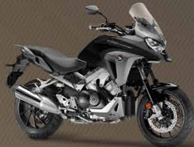
▲ MATT GUNPOWDER BLACK METALLIC